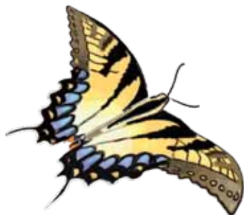
Western Tiger Swallowtail