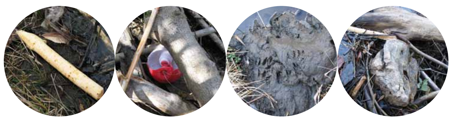
Answers: All of them: sticks, fishing float, mud, and stones.

Which of these things do you think beavers might use to build a dam?