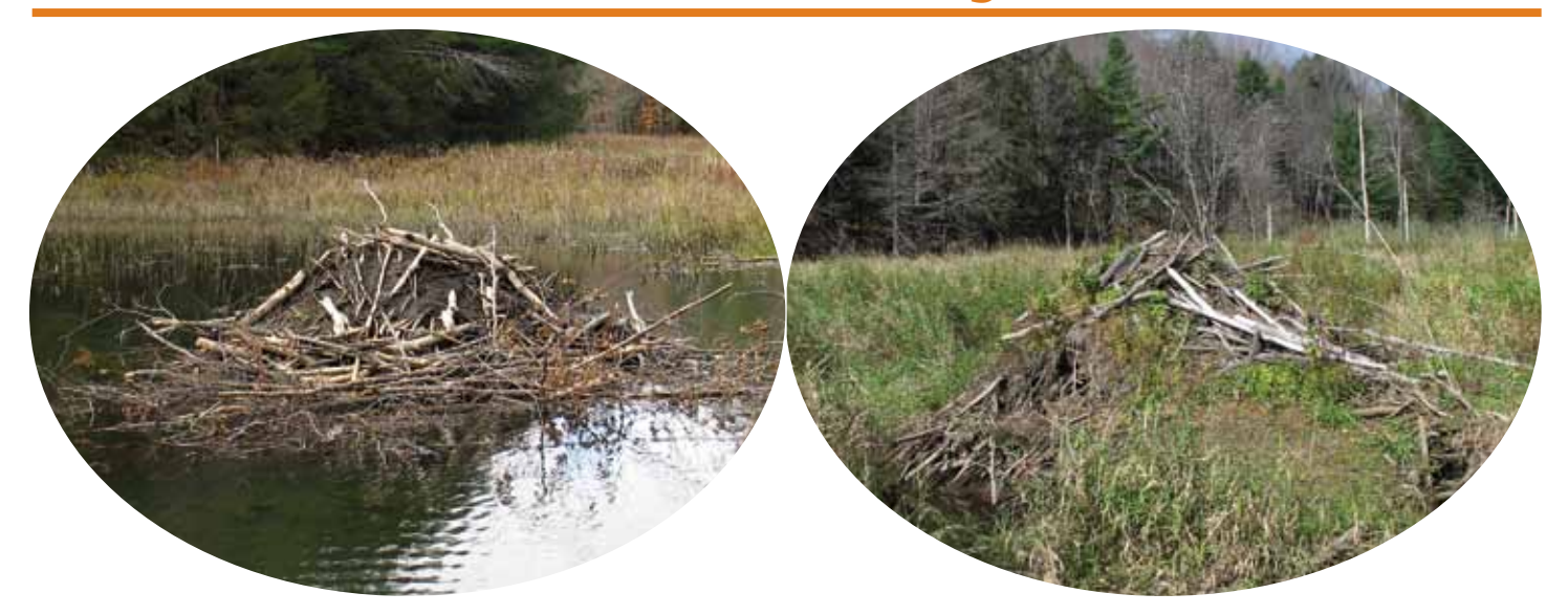
Beaver Lodge in Pond