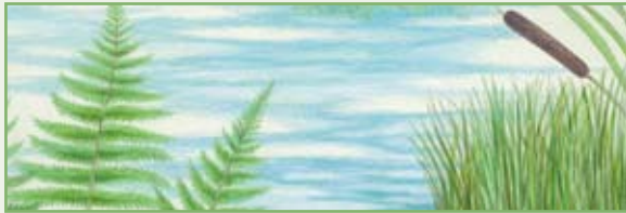
ponds, wetlands, and slow-moving rivers