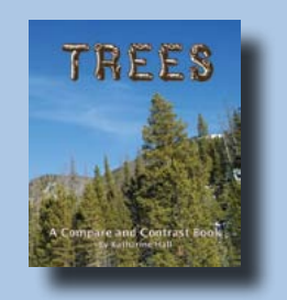
TREES: A COMPARE AND CONTRAST BOOK

Beginning with the roots, this cumulative verse story climbs the tree to a surprise ending. A creative twist to The House that Jack Built.